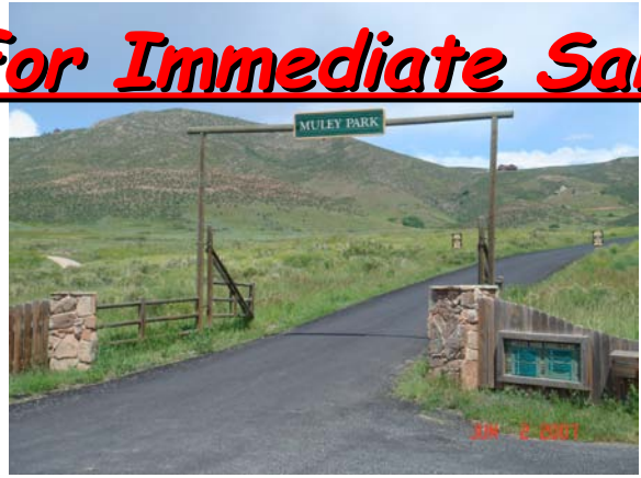
Entrance to Muley Park: Controlled Access to Covenant Protected Estates