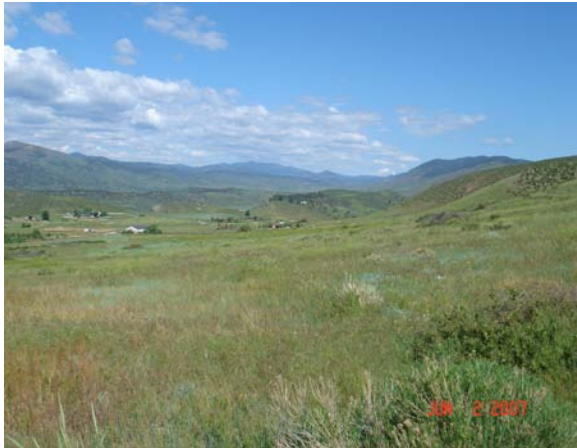
View to the west from the property