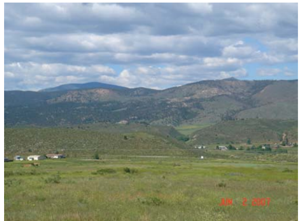
View to the southwest from the property

For More Information or for a Private Showing call: